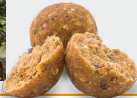
Ian Day Sonubaits.com