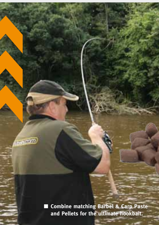
■ Combine matching Barbel & Carp Paste and Pellets for the ultimate hookbait.