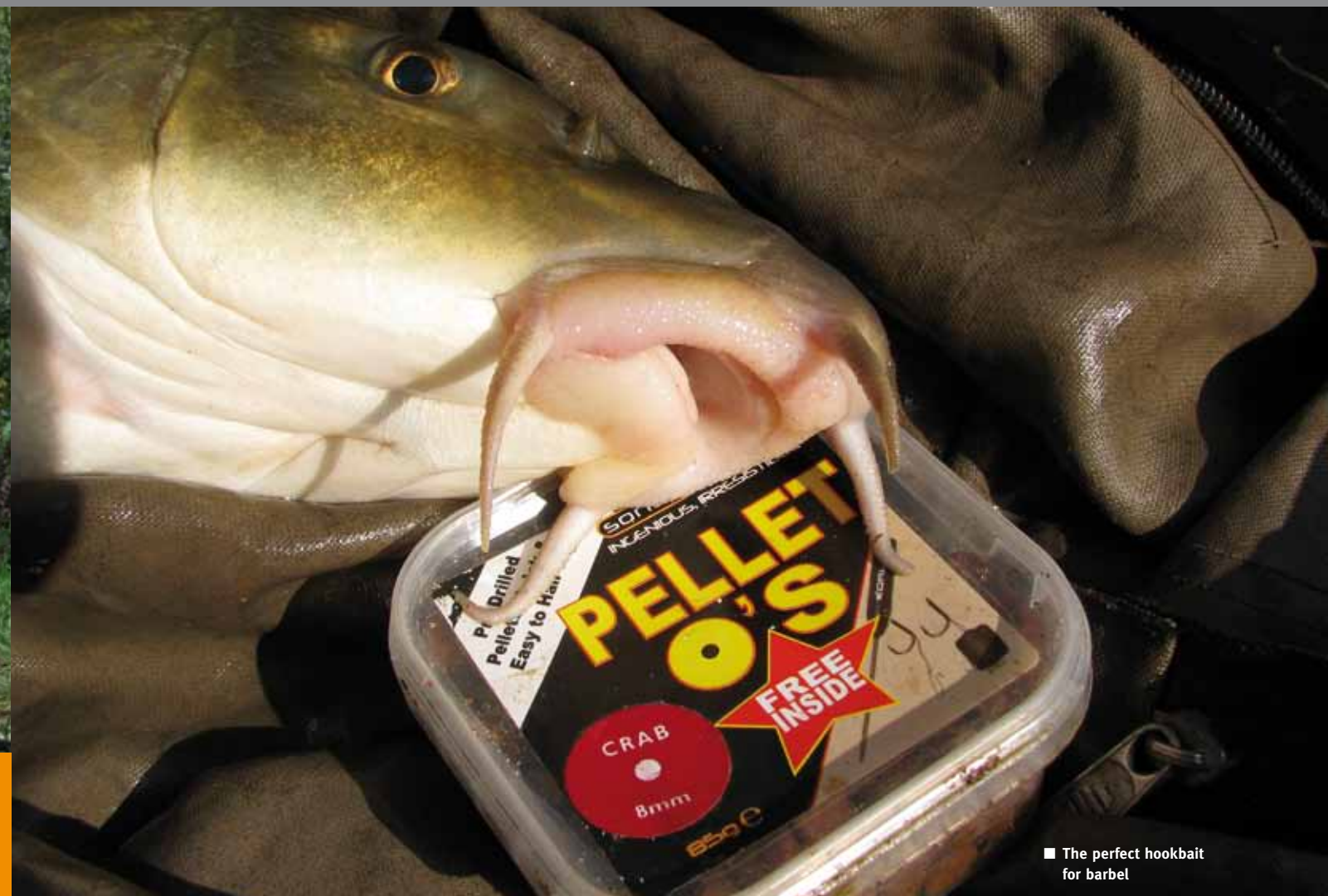
■ The perfect hookbait for barbel

"Have I ever looked back, or used a PVA bag since...No!" he states.